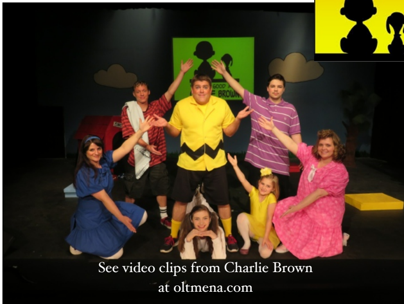
See video clips from Charlie Brown at oltmena.com