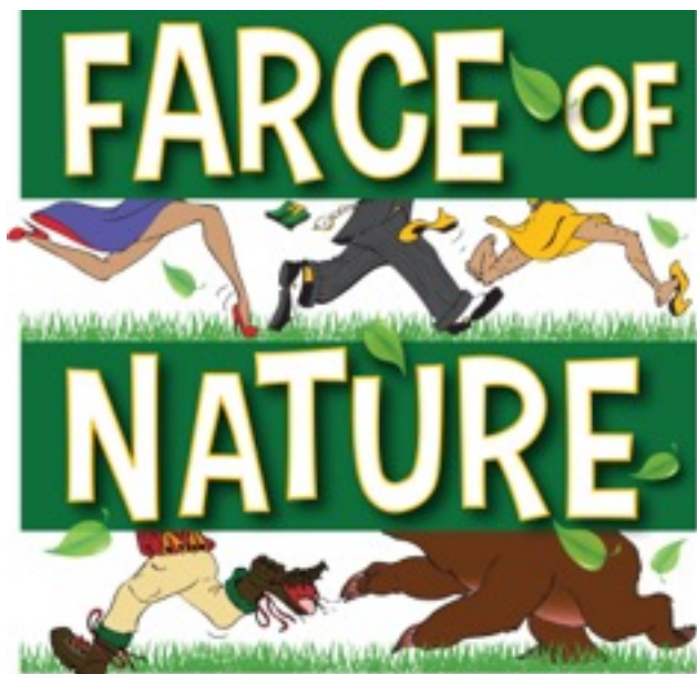
a jones hope wooten comedy

Farce of Nature to Open Valentine's Day Feb. 14 2019 as dinner theatre at Mena Mountain Resort